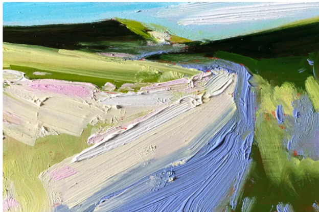
"Pathways" by Pete Hocking